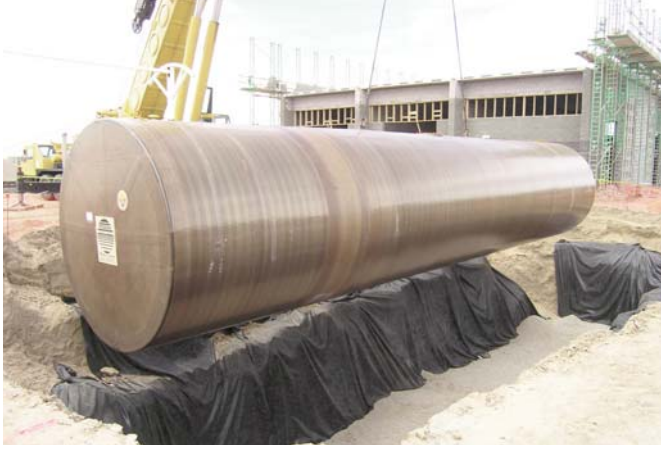
Meets EPA Leak Detection Requirements for Underground Storage Tanks

PERMATANK® double-wall jacketed underground storage tank features an inner steel tank coupled with an exterior corrosion-resistant fiberglass tank. A unique standoff material separating the inner and outer tanks creates a uniform interstitial space ensuring rapid and accurate leak detection.