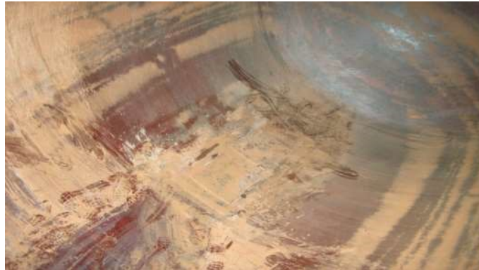
ASTSWMO Case summary #1: Damaged Internal Lining (FRP)

Microbial contamination is caused when water collects in a tank and mi-