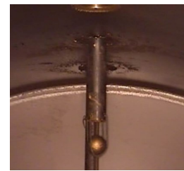
Corrosion on fittings in an FRP tank (left) and a steel tank (right). Both tanks store ULSD.