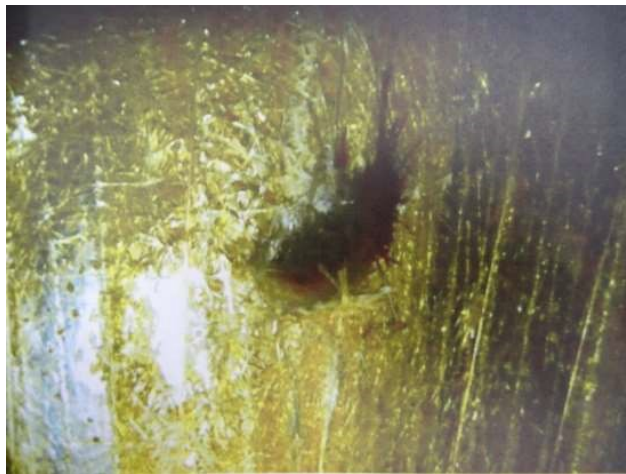
ASTSWMO Case summary #20: UST fibers exposed due to chemical exposure (FRP)

crobes are present. Their reproductive processes yield waste products that can corrode internal surfaces.