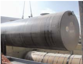
AquaSweep™ Installation at Chicago's O'Hare International Airport